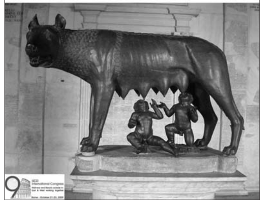
Fig. 19 Marco Aurelio and the capitoline wolf, symbols of Roma.