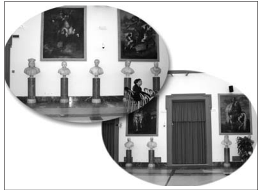
Fig. 6 Particular view of the Protomoteca (hall in Campitulum).

A healthy environment, and a correct diet associated with care for one's body using cosmetics carefully formulated and tested for their effectiveness and lack of side effects, were the themes treated by the experts from various cultures during the three day meeting.