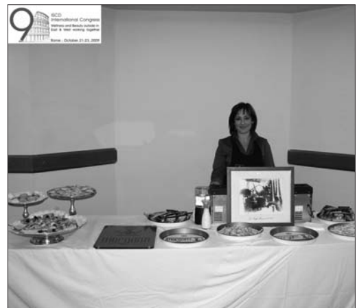
Fig. 16 Coffee break offered by Caffè Morganti.

The three-day Meeting dedicated mainly to the relationship between environment, products and wellness was also characterized by special events.