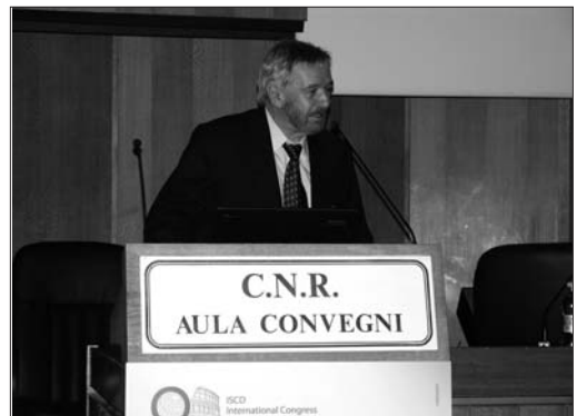
Fig. 12 Prof. Jacek Arct eminent Polish Chemist.

A healthy diet must always be accompanied by attentive body care through the use of cosmetic products with well demonstrated effectiveness. The effectiveness of a cosmetic product is tied not only to its active ingredients but also to the carrier employed that guarantees its bioavailability. There are already valid protocols in vitro and in vivo , to evaluate the efficacy and safety of cosmetics, as reported by Jacek Arct, of the Academy of Cosmetic Science, University of Warsaw (Fig.12).