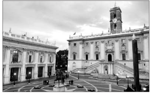
Fig. 5 Campitulum Square.