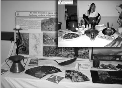
Fig. 17 Typical foods and culture based on the ancient Veroli civilization.