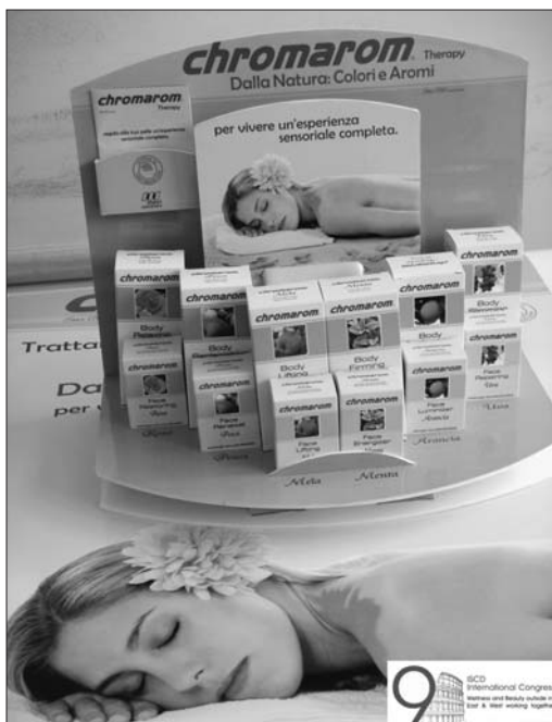
Fig. 21 The NICE concept through the use of a new family of cosmetics.

This is another clear message that along with the NICE concept that characterizes innovative cosmetics of recent generation, reflects the intentions and the novelties presented in this important multidisciplinary Meeting (Fig.21).