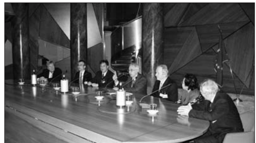
Fig. 20 Closing Ceremony in the Sala delle Colonne of the Italian Parlamento.