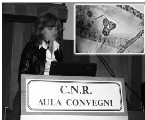
Fig. 9 Prof. Patrizia Perego from the University of Genoa showing interesting data on the use of Algae.

the air, not to mention their use to produce bio-fuel. Many food supplements contain algae extracts rich in antioxidants and essential amino acids, that have been shown to reduce hyperglycemia and hyperlipidemia, as well as inflammation (fig.9).